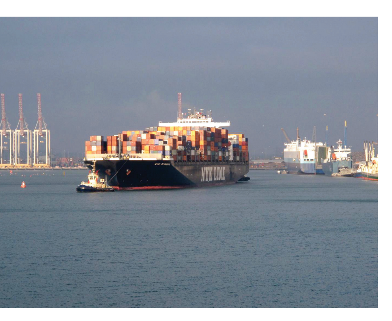
In early 2013, Japan's NYK line ship 'Olympus' transported over four tonnes of Norwegian whale products to Japan.

The Convention on International Trade in Endangered Species of Wild Fauna and Flora was agreed to in March 1973 and entered into force in July 1975. Large whales were among the first species protected under CITES: At the first CITES CoP in 1976, blue, humpback, gray and right whales were listed in Appendix I (effectively banning international commercial trade). At CoP2 in 1979, all great whales were included either in Appendix I or II (i.e., international trade restrictions). At CoP3 in 1981, fin, sei and sperm whales were transferred to Appendix I, with the result that all whales then protected by the IWC also received CITES's strongest protection. In 1986, CITES responded to the IWC moratorium by including the last remaining great whales in Appendix I. ^{46} However, like the ICRW, CITES allows parties to lodge a formal reservation within 90 days of a CITES decision, exempting them from its effect.