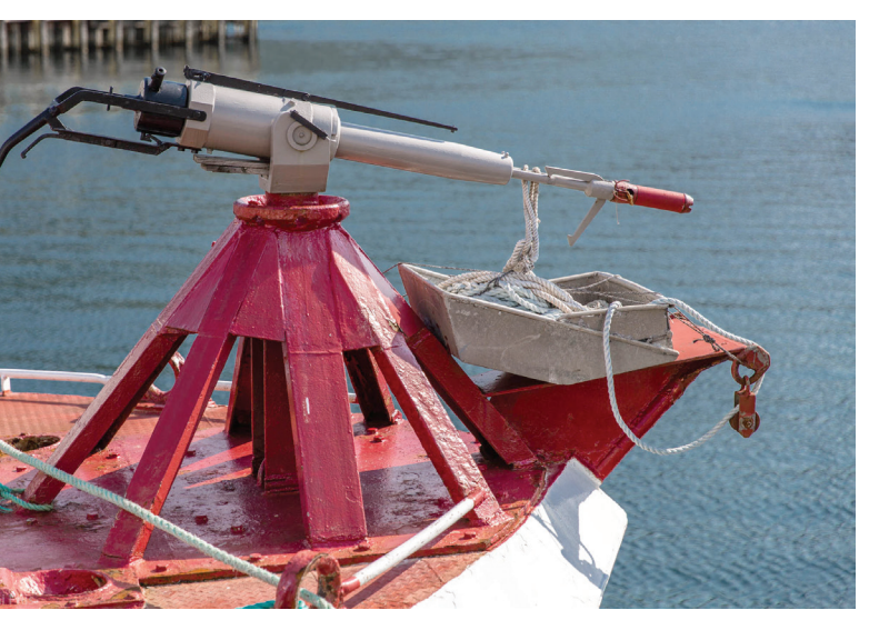
Norwegian explosive harpoon. 18 percent of harpooned minke whales in Norway do not die instantaneously. (Kai Friis)

Norwegians are split over whaling and apparently ambivalent about its humaneness; according to polls, 31 percent support whaling, regardless of potential suffering of the animals, but 42 percent oppose whaling if some whales suffer before dying. 120