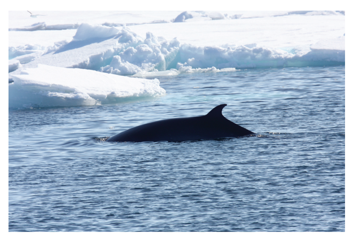
A north Atlantic minke whale off Svalbard, Norway.

In recent years, expanding whaling by Japan and Iceland has dominated both headlines and diplomacy; Japan lost a legal challenge to its special permit or 'scientific' whaling programme at the International Court of Justice and Iceland remains the target of diplomatic sanctions by the United States. In contrast, Norway has been spared international attention and diplomatic pressure, and has made the most of this vacuum. Since 2010, the Norwegian government has continued to use an unapproved method to set its quotas, and relaxed a number of whaling regulations that it originally introduced in response to criticism by the IWC. It has subsidised research into new uses of whale oil and other products and quietly prepared the ground for increased exports, resulting in nearly 150 tonnes of whale meat and blubber being exported to Japan. It has also become less transparent about the welfare implications of its hunt.