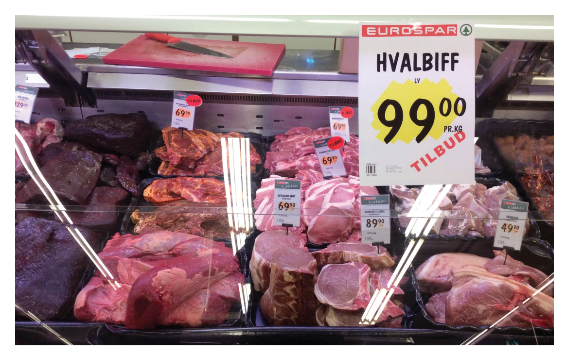
The Netherlands-based SPAR group continues to defy international condemnation by selling whale meat in its Norwegian outlets.

From 2004 to 2009, the public relations programme cost US$400,000/year.92 Although it did not immediately result in the desired effect, 93 revenues at several of the leading whale meat companies have increased in recent years. For example, Lofothval's