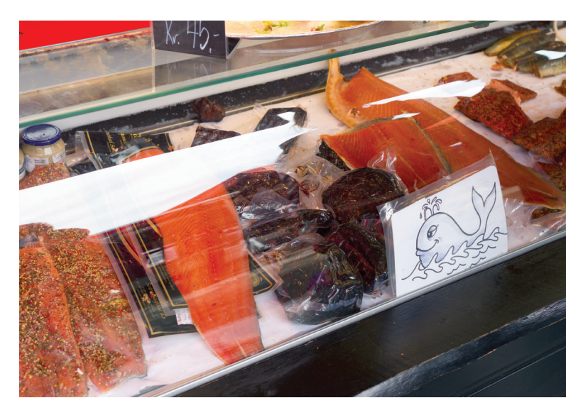
Fresh whale meat steaks on sale in 2014 at a fish market in Bergen, southeast Norway.

At its 64th Meeting in 2012, the IWC unanimously passed Resolution 2012-1, which recalls that organic contaminants and heavy metals '... may have a significant negative health effect on consumers of products from these marine mammals' and urges parties to '... responsibly inform consumers about positive and negative health effects, related to consumption of some cetacean products'.