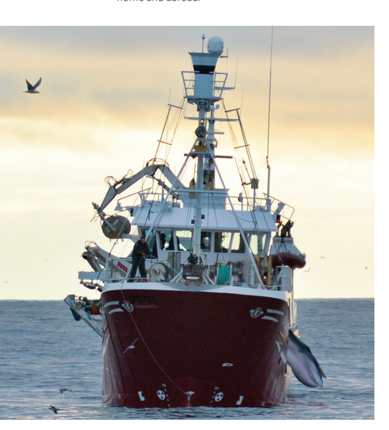
Norwegian whaling ship 'Reinebuen' south of Svalbard, May 30, 2015

With the attention of media, politicians and the public focused elsewhere since the beginning of the new century, Norwegian whaling has boomed, exploiting loopholes in international whaling and trade bans and using unapproved science to set its own quotas for hundreds – sometimes more than a thousand – whales a year. Now with its domestic market for whale meat saturated due to low demand, Norway is not only exporting meat to established markets in Japan, it is even funding the development of new food-supplement and pharmaceutical products derived from whale oil in an effort to secure new customers, both at home and abroad.